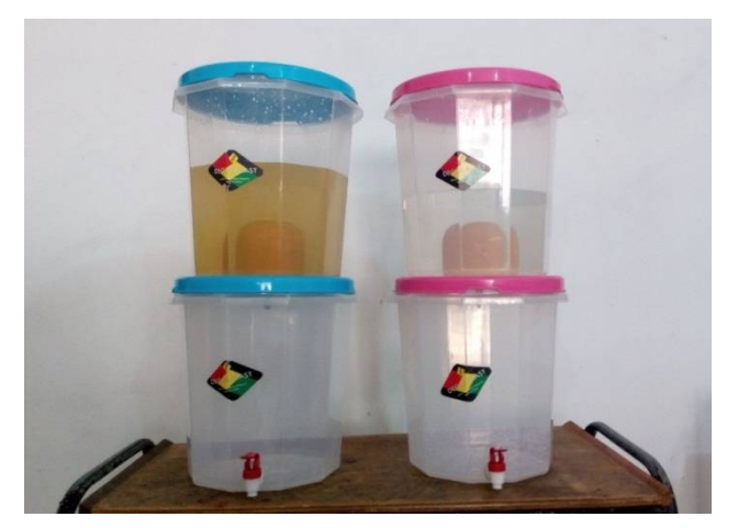
Fig. 1: Assembled Filter Unit