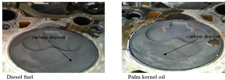
Fig. 1: Carbon deposit on piston surfaces after the durability test

higher. This is because of the higher viscosity of the palm kernel oil. Higher viscosities lead to reducing in-cylinder temperatures which reduces fuel atomization efficiency creating fuel rich zones which is one of the cause of incomplete combustion (Hellier et al., 2015). There will be a need to retard the injection timing to arrest this situation.