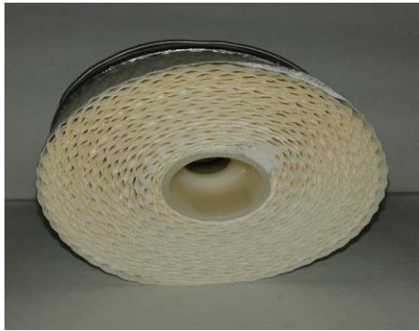
Fig.4: Unused fuel filter before durability test with palm kernel oil fuel

Each of the filters used for the petroleum diesel and raw palm kernel oil run were examined after 100 hours of engine run. Figure 4 depicts condition of the unused filter before experimentation.