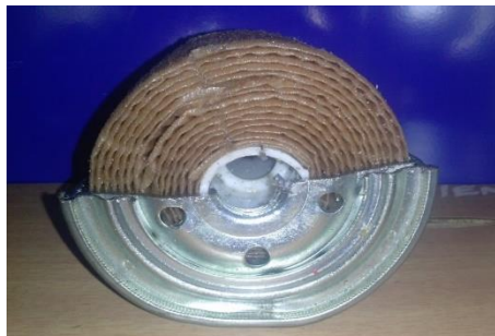
Fig.5: Fuel filter after durability test with petroleum diesel

Figure 5 represents the condition of the fuel filter after it was run on petroleum diesel for 100 hours. It was observed that the use of petroleum diesel did not cause any significant damage to the fuel filter compared with palm kernel oil.