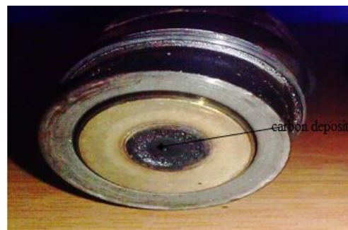
Fig. 1: Fuel injection nozzle tip after durability test with petroleum diesel

The Fuel Injection Equipment (FIE) manufacturers also accept the use of biodiesel blends up to B7 meeting EN 590:2009, provided the biodiesel meets EN14214:2009. There is thus no standard for Nozzle use beyond B7. Inspection of injection nozzles for both instances of petroleum diesel and palm kernel use showed contrasting results. There was rather carbon deposition on the nozzle tip of engine used with petroleum diesel. In contrast, less carbon deposit was found around the nozzle orifices in the palm kernel oil engine. Figure 2 and 3 shows the carbon deposit on the surface of the nozzle of both fuel cases.