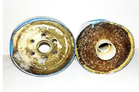
Fig. 6: Plugged fuel filter split after durability test with palm kernel oil fuel

After the durability test with the palm kernel oil fuel as shown in figure 6, it was observed that the fuel filter was plugged with oil due to its high viscosity. In addition, there were some impurities other than oil found on the filter indicating the palm kernel oil might not have been well prepared.