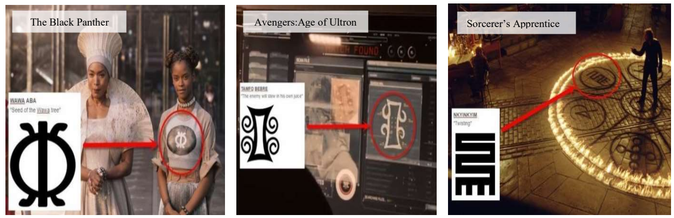
Figure 1 – Hollywood movies that showcase Adinkra symbols

The use of Adinkra Symbols in Ghana and even beyond has increased over the years. The Adinkra symbols have even been spotted in Hollywood movies such as Black Panther, Avengers: Age of Ultron and the Sorcerer's Apprentice. The screen short of the symbols displayed in the Hollywood movies is displayed in figure 1 .