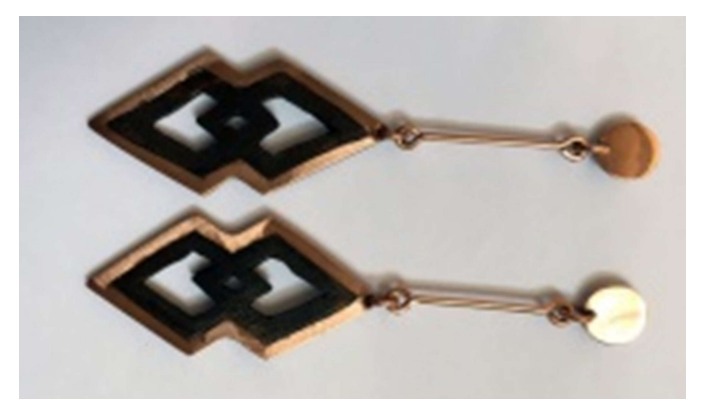
Figure 4– A creative work under textiles

Moreover, Esteem needs are honour for oneself such as dignity, achievement, mastery, independence (Maslow, 1970). This symbol is also in agreement with the function of the sample because the designer might have thought of achievement and independence of the state (Ghana) which is Esteem to the country. Therefore, that sample was also checked ' * '. On the other hand, in figure 4 the symbol " Epa " (Handcuff) was used to create earring for decoration and beautification but this symbol falls under Safety Needs (Aboagyewaa, 2018).